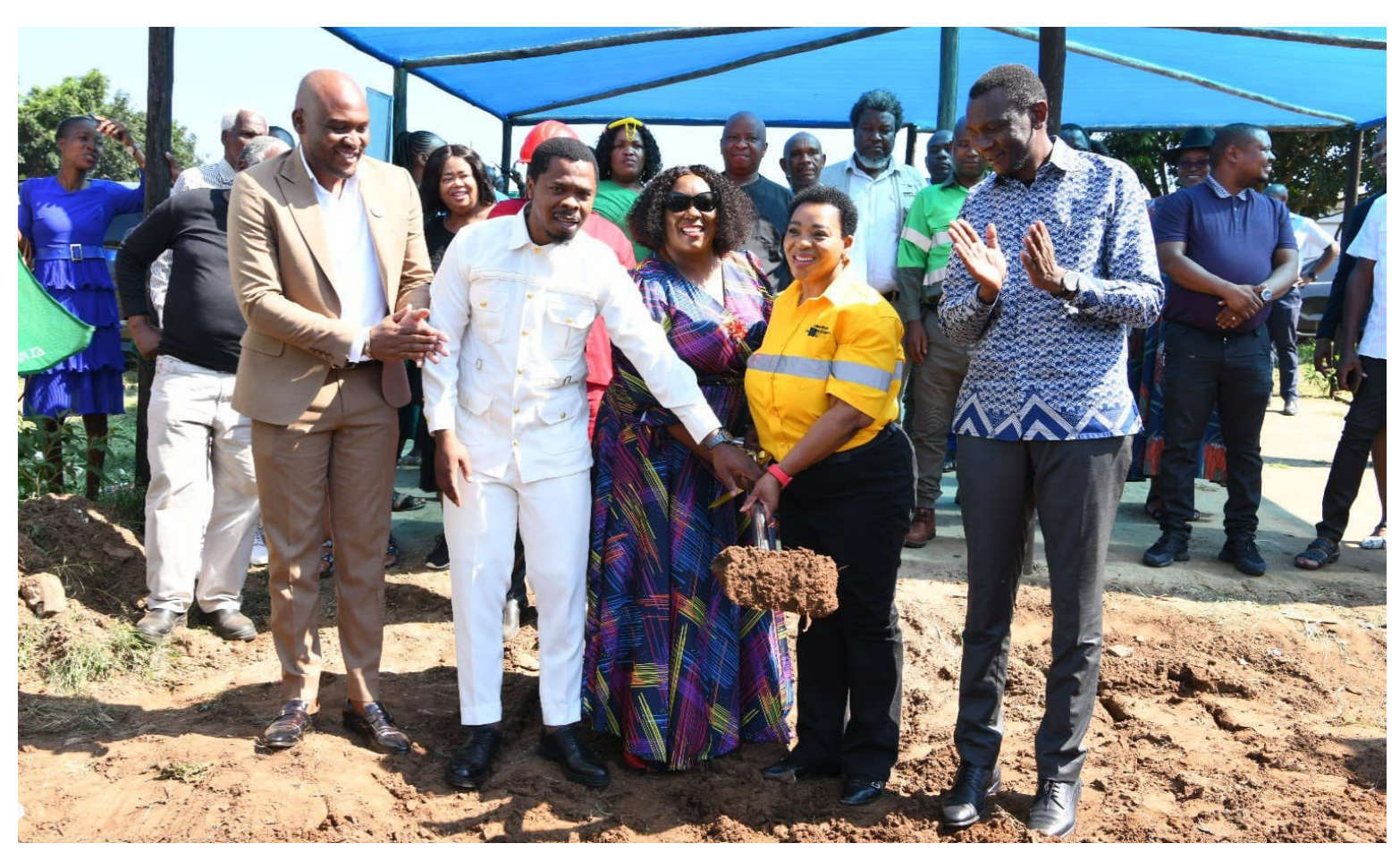
KwaZulu-Natal Premier Nomusa Dube-Ncube, Health MEC Nomagugu Simelane, UMkhanyakude District Municipality Mayor Siphile Mdaka presiding over the sod-turning ceremony at the construction site of the Umtubatuba Community Health Centre on 19 April 2024.

The Premier concluded her address by handing over ten vehicles to Community Policing Forums (CPFs) in Umkhanyakude District Municipality. The ten cars are part of a fleet of 85 vehicles that were unveiled during the handing over of tools of trade to Community crime fighting structure, in Durban, on 5 April 2024.