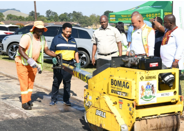
KwaZulu-Natal Premier Nomusa Dube-Ncube overseeing the tarring of potholes in Ward 4, Intshanga, ahead of the Provincial Government's Crime Fighting and Service Delivery Imbizo on 24 April 2024.