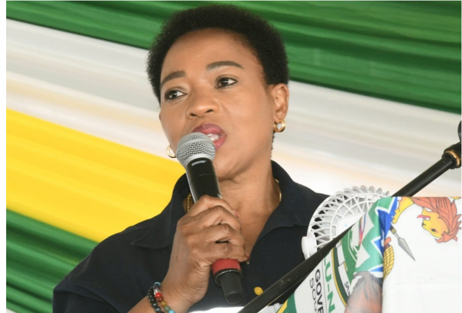
KwaZulu-Natal Premier Nomusa Dube-Ncube addressing the Inchanga community during multisectoral Imbizo on 24 April 2024 at Intshanga within the eThekwini Metro Municipality.

Society's involvement in substance and illicit drug abuse usually results in crime, road traffic accidents, or those involving pedestrians, as well as injuries due to intoxication. The burden of alcohol, tobacco, and other drug problems presents a major challenge for the province of KwaZulu-Natal and its people. The prevention and combating of substance abuse is the responsibility of every member of society as well as government departments, as designated by the National Drug Master Plan.