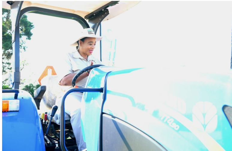
KwaZulu-Natal Premier Nomusa Dube-Ncube Ncube inspecting the tractor which was handed over by the Provincial Government to SyaJay Agricultural Services in Bainesfield, Richmond ahead of the integrated development programme in ePhatheni Sports Field on 18 April 2024.