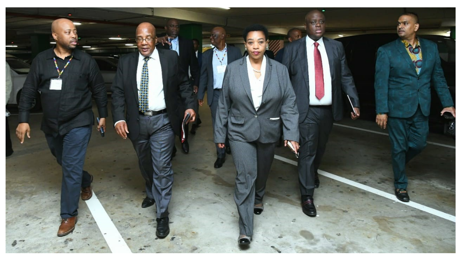
KwaZulu-Natal Premier Nomusa Dube-Ncube, Minister of Home Affairs Dr. Aaron Motsoaledi and Deputy Minister Njabulo Nzuza arriving at the Pavilion Shopping Centre in Westville for the official opening of a new Home Affairs office.